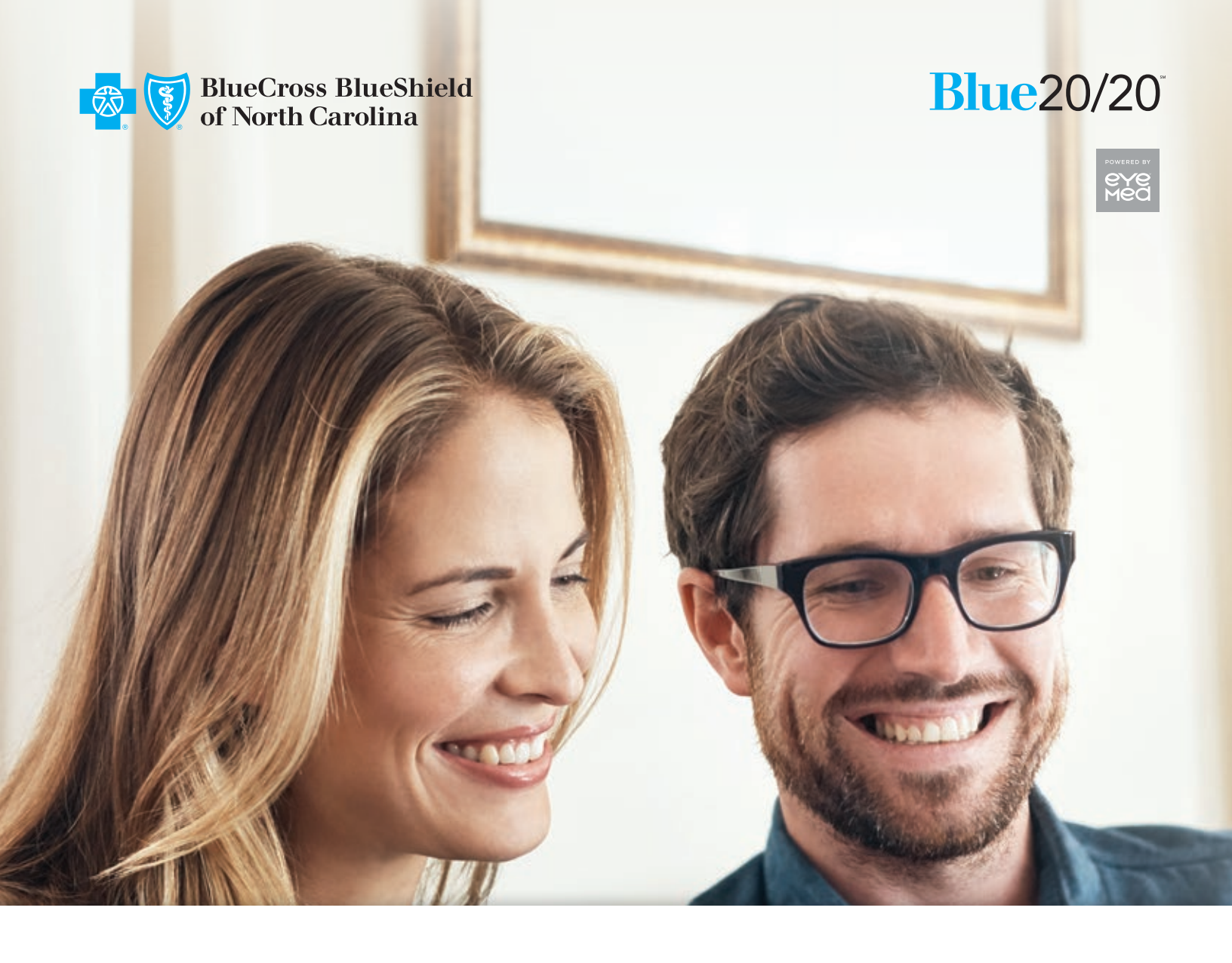
2024 GROUP VISION PLANS | Focused on choice