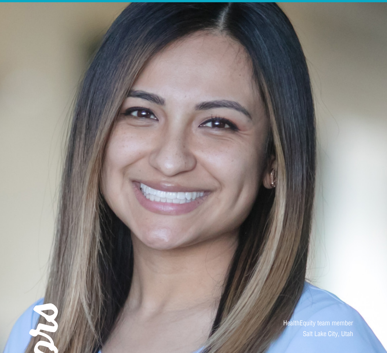
HealthEquity team member Salt Lake City, Utah

HealthEquity is available to help, every hour of every day